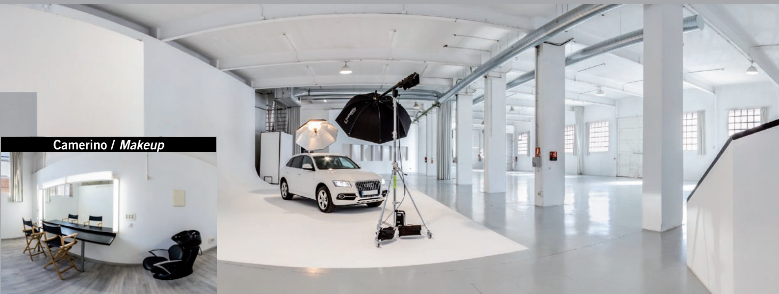
Camerino / Makeup